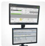
LCD and touch-screen mounts

Accessories shown here are just a sample of what we offer; visit newcastlesys.com or ask your salesperson for a complete list.