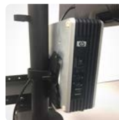
Thin client and CPU mounts